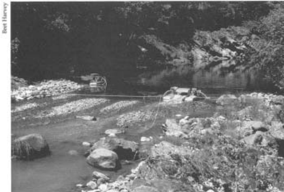
A miner works upstream of these dredges in Butte Creek, California, at a depth of greater than 2 meters.

However, not all benthic invertebrates can be expected to rapidly recolonize disturbed areas. For example, many mollusks have low dispersal rates (Gallardo et al. 1994) and limited distributions in river systems (Green and Young 1993). Many aquatic insects also have limited geographic ranges (e.g., Erman and Nagano 1992). Populations of such species may be influenced strongly by local events such as suction dredging. Unfortunately, only about one-quarter of the freshwater mussels in the United States and Canada have stable abundances (Williams et al. 1993), and little is known about mussels in states where suction dredging is common (California, Idaho, Oregon, Washington). The challenge of evaluating the effects of dredging on aquatic invertebrates is often exacerbated by a lack of taxonomic information.