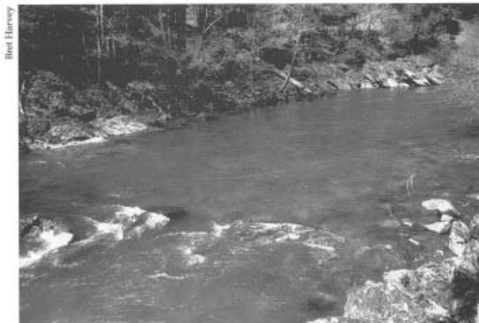
This is the same site in spring of the following year. The log at water's edge in the upper, center-right of this photograph is visible in the upper center of the photo above.